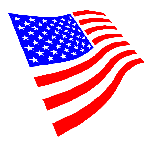
The Sacramento Chapter Sons Of The American Revolution

4305 Elizabeth Avenue Sacramento, CA 95821-4140 TO THE POSTMASTER ADDRESS SERVICE REQUESTED