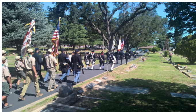
Memorial Day Parade at Sylvan Cemetery