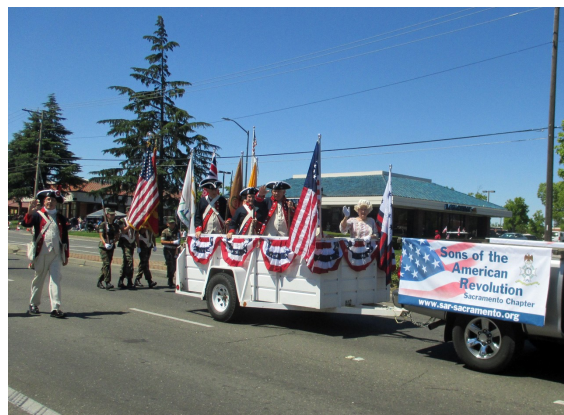
This was one of the lead units