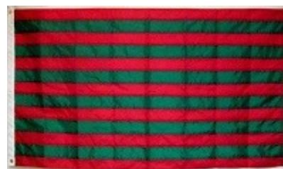
George Rogers Clark flag