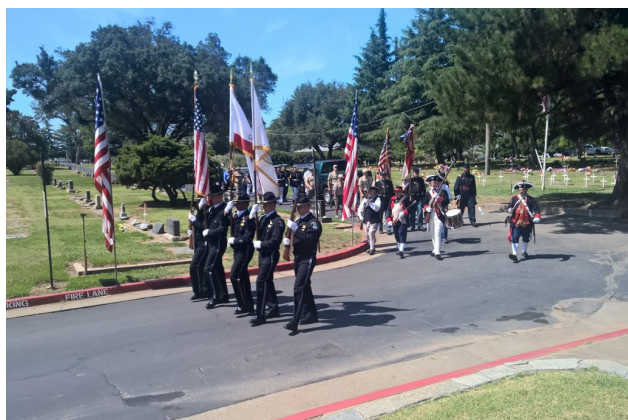
Memorial Day Parade at Sylvan Cemetery