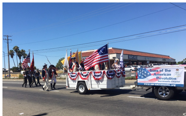
Independence Day Coming down Fair Oaks Boulevard in Carmichael