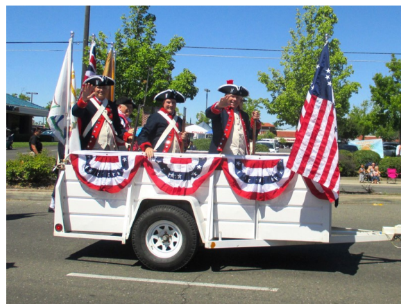
Looking sharp; waving to the crowd.