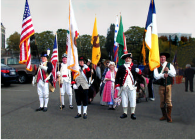
Ready to March: Pictured Left to Right