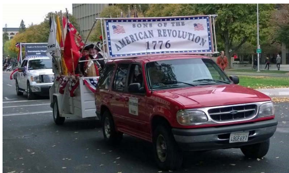
The Sacramento SAR float coming down Capital Mall during the parade. A DAR contingent was in the vehicle behind.