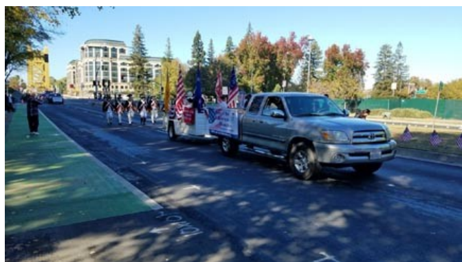
The truck and trailer followed by the Color Guard