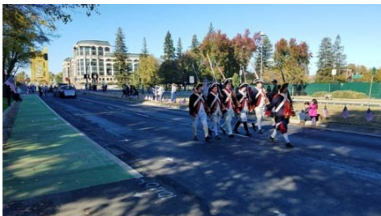
The Chapter Color Guard, just after entering Capitol Mall toward the beginning of the parade

The Chapter Color Guard again participated in the Annual Veteran's Day Parade down Capitol Mall. The parade regularly starts at 11:00 AM on November 11. The time and date are set to coincide exactly with the signing of the truce that marked the end of the fighting in WWI. The truce was signed at the 11th hour of the 11th day of the 11th month. This year marked the 99th anniversary of that event.