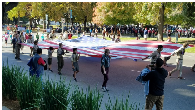
Scouts in the staging area, getting ready to carry this enormous flag in the parade.