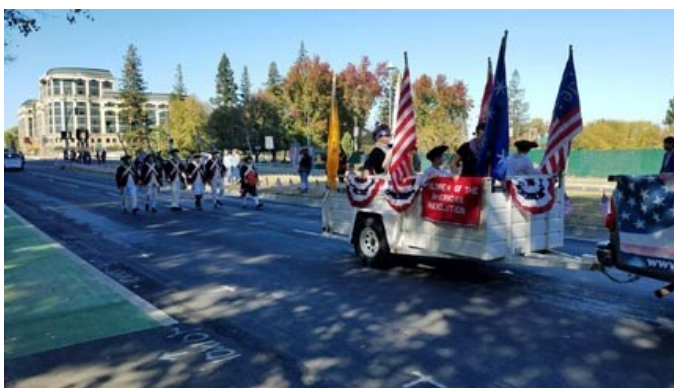
The Sacramento Chapter float