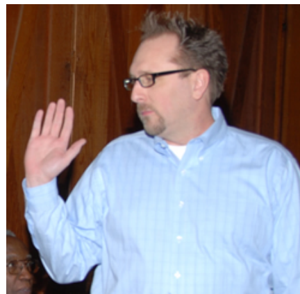
Taking the oath