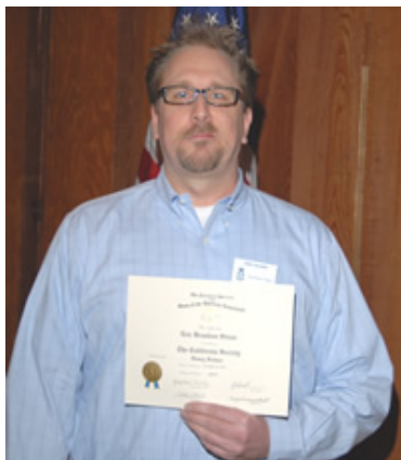
With Membership Certificate