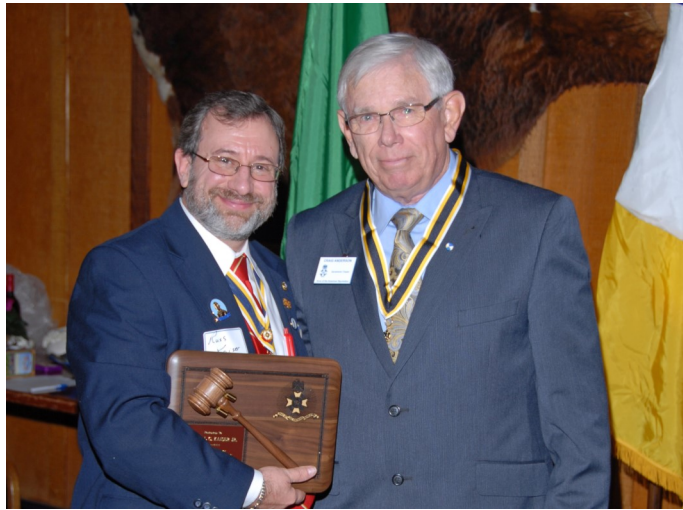
Changing of the Guard