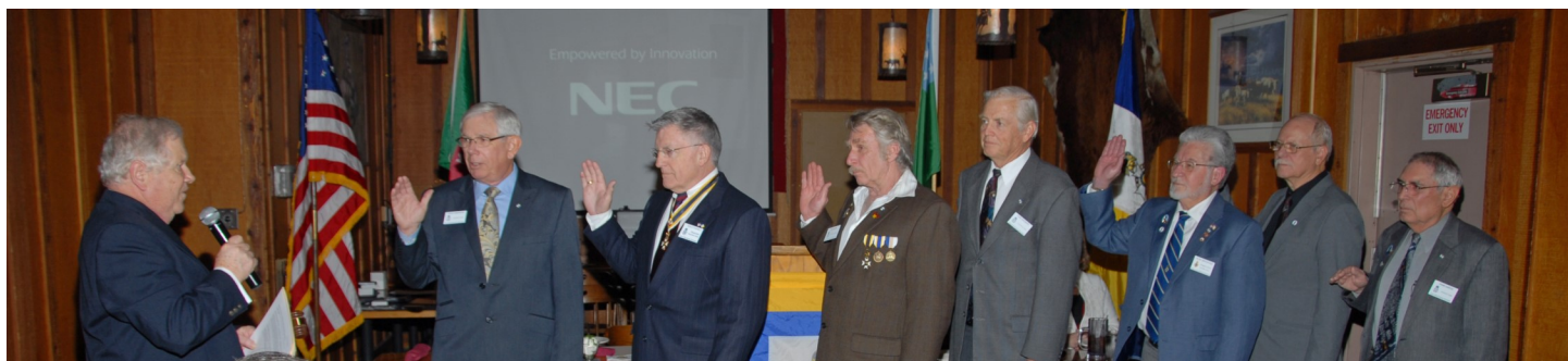
Administering the oath of office for 2015 officers