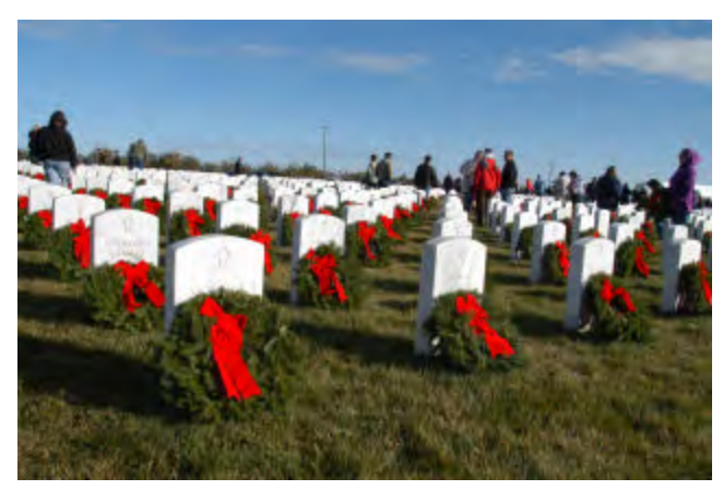
After the wreaths were laid.