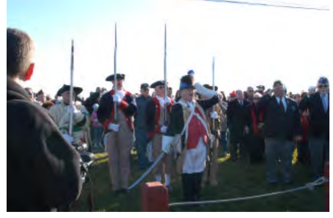
Color Guard at Present Arms.