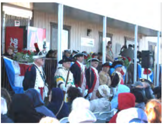
Color Guard during the ceremony.