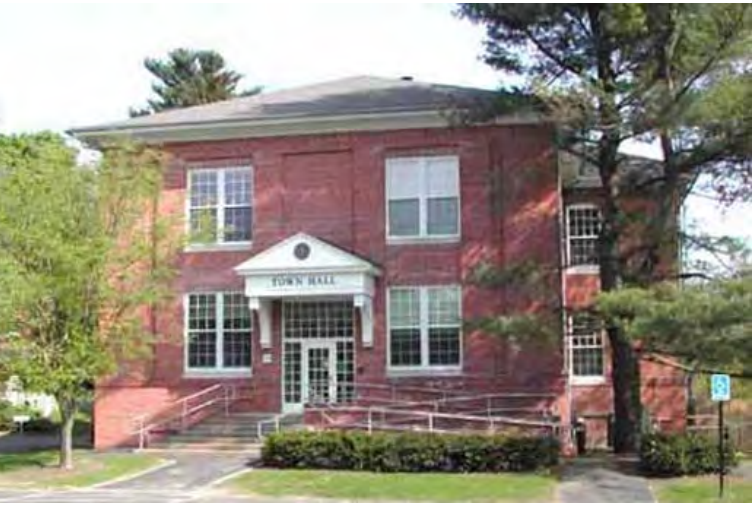
Town Hall in Sherborn, Massachusetts.

As we go into the fourth year of this news letter perhaps it is time to add the Forward/Preface. The publication of the American Revolution by the month corresponding to the current month two hundred and twenty years ago began in April 1996. My early years were spent in the town of Sherborn, Mass, and I grew up with great pride in the Minutemen who marched from our town to help send the Redcoats running back to Boston. In April of 1996, the first letter appeared, corresponding to the same month in 1775. There was no intention of going further. With encouragement, the next letter appeared and has continued monthly, except for a slight holiday in 1996 caused by a lack of my