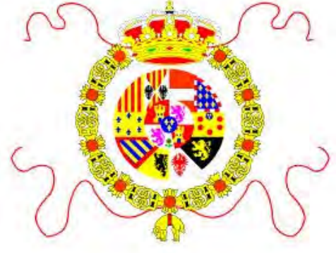
Artist's rendition of the Spanish State and War Ensign

This flag is the highlight of the Sacramento Chapter's flag collection. Obtaining the flag is a story in itself. In doing research for the 2008