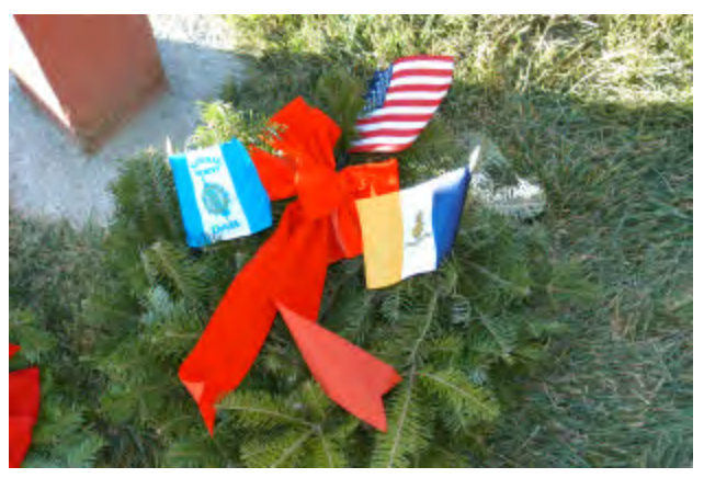
Wreath dedicated by the DAR and SAR.