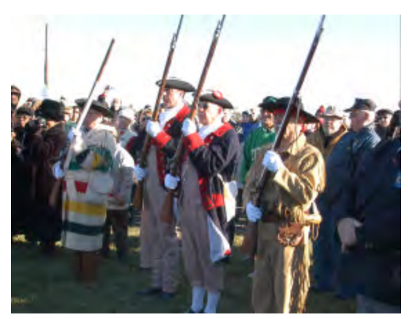
The Riflemen at Present Arms.