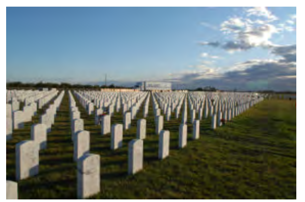
Cemetery before the start of the Ceremony.