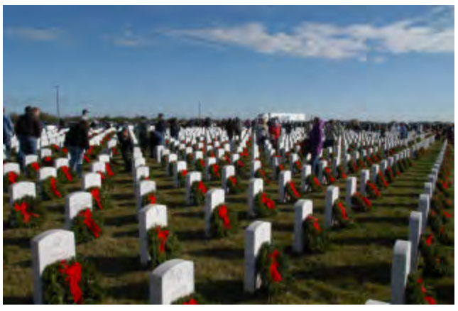
After the wreaths were laid.