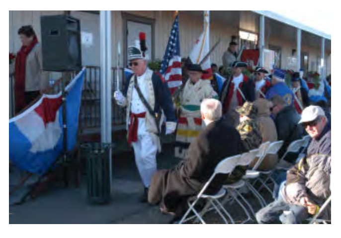
Color Guard Exiting the Ceremony.