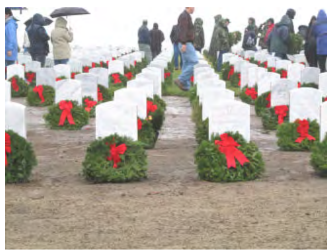
Sacramento Valley National Cemetery after the wreaths have been laid.