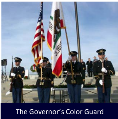
The Governor's Color Guard