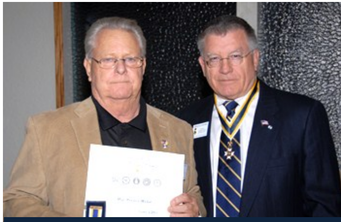
Robert Tolman receives War Service Medal