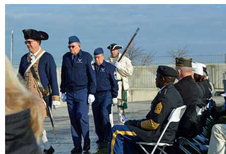
Photos from the ceremony as described above