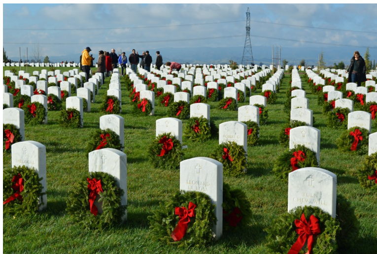
Veterans graves decorated with wreaths