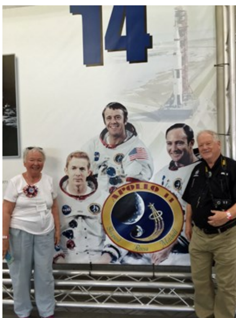
A visit to Houston means fraternizing with astronauts