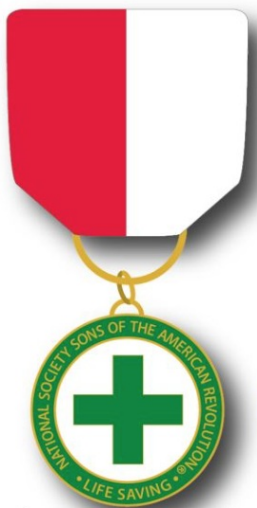
Life Saving Medal