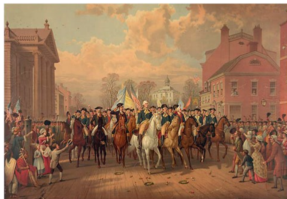
Washington and his army entering Boston the day after the British leave.