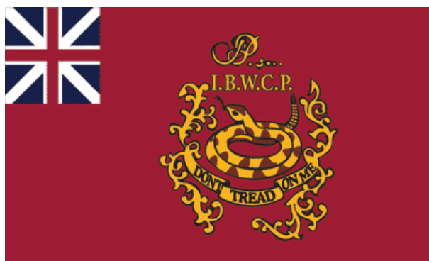
"Don't Tread on Me"

Fort Moultrie was a series of fortifications on Sullivan's Island, South Carolina, built to protect the city of Charleston. The flag was also called the Liberty flag and was designed, by commission in 1774, by Colonel William Moultrie, to prepare for war with Great Britain. It was flown by his troops in the successful defense of Sullivan's Island against the British fleet in June 1776.