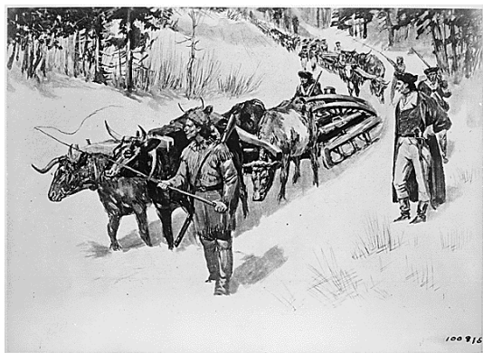
Cannon from Fort Ticonderoga in upper New York, a difficult mid winter journey.

March 17, the day of our March meeting, is the 241 st anniversary of the British withdrawing their army from Boston. Heavy artillery weapons had arrived from Fort Ticonderoga and the Continental Army's new commander, George Washington, had placed them strategically on the hills surrounding the city, effectively boxing in the British army and forcing them to leave. The following day the Continentals occupied the city. The British would regroup in Nova Scotia and later in the summer of the same year would meet Washington's army in New York City.