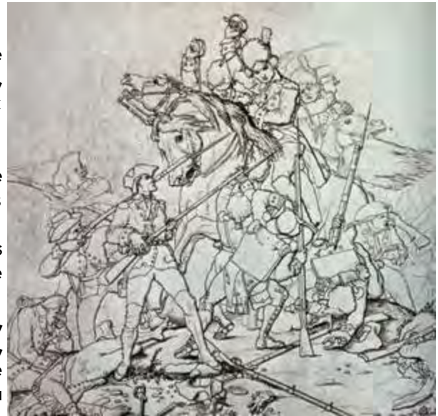
Sketch of the Waxhaw Massacre thought to be for a 19th century lithograph.

became the American battle While Tarleton led a charmed life and escaped the war unscathed, Tories would pay at King's Mountain for the