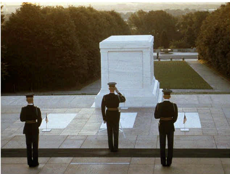
Tomb of the Unknown Soldier - Arlington National Cemetery