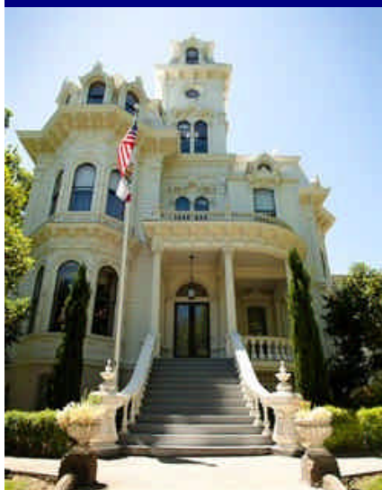
Historic Governor's Mansion