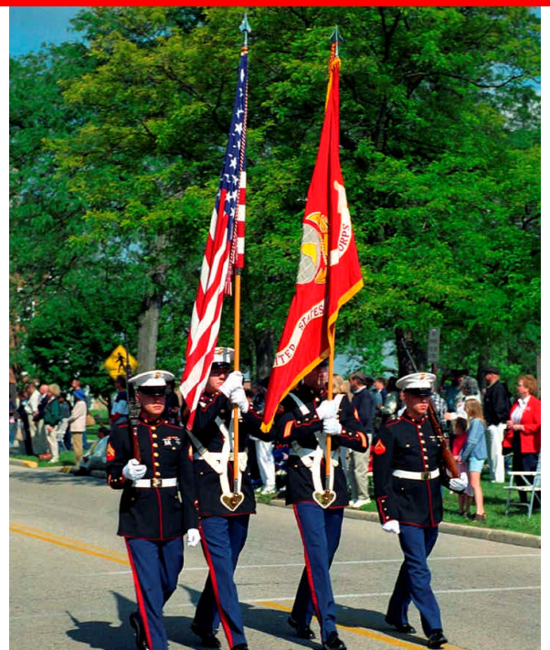
U. S. Marine Honor Guard