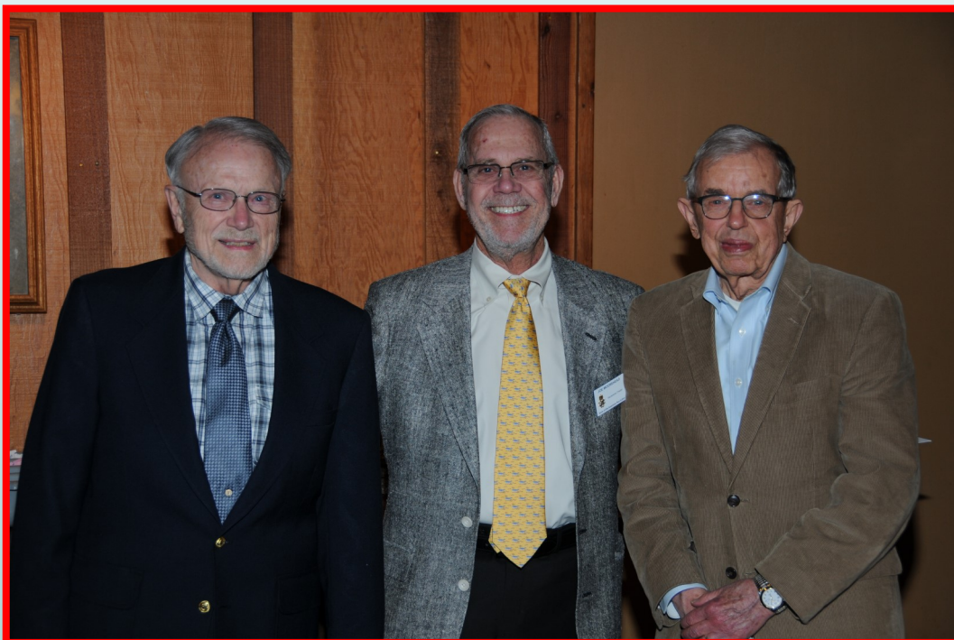
ALSO KNOWN AS THE EDITORS