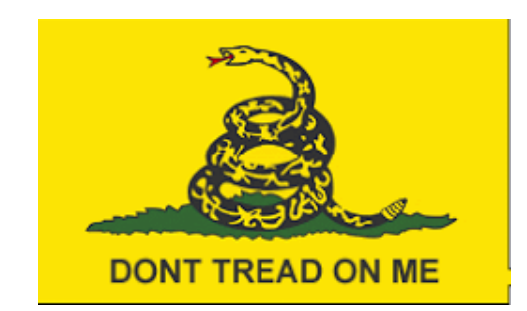
The Gadsten Flag was used in the early Revolutionary era as a symbol of Independence and Freedom

Taunten Flag: First raised in 1774 in Taunten, Massachusetts after the citizens drove Loyalists from the town