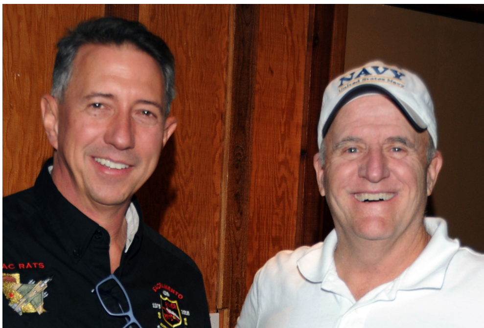
Tom Jones & his Guest