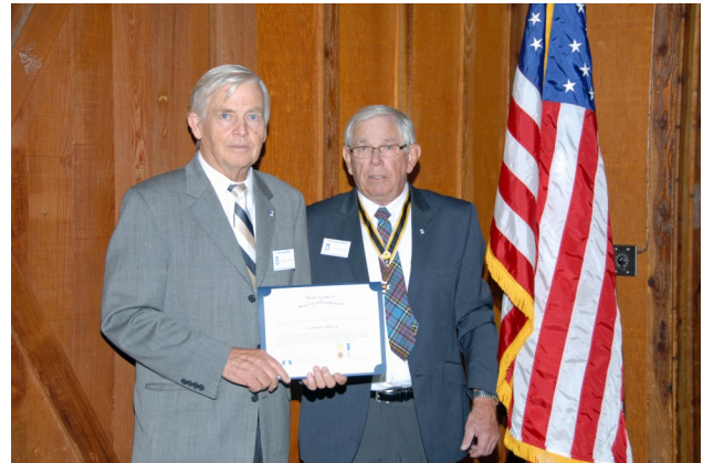
Vietnam War Veterans Corps