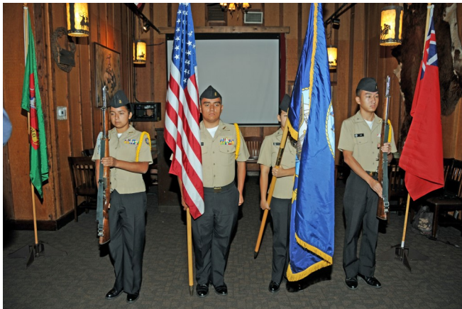
Luther Burbank H. S. NJROTC Presenting the Colors