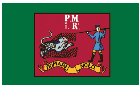
Pennsylvania 1st Continental Regiment