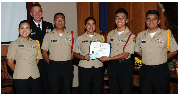
Luther Burbank H. S. NJROTC & Cert. of Appreciation