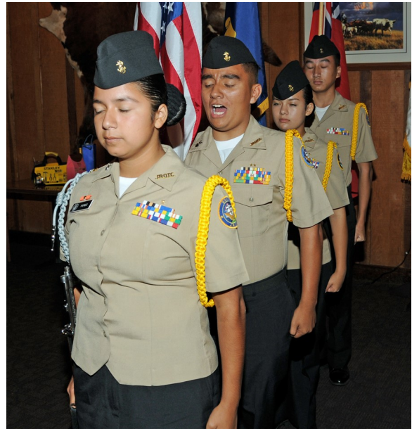
NJROTC Honor Guards Doing Maneuvers