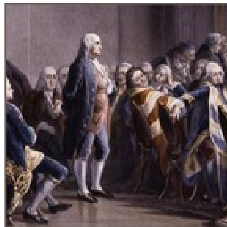
Franklin in the Cockpit. The fancy velvet suit he wore here would be worn again in 1783 when he was signing the Treaty of Paris that ended the Revolutionary War. He considered that a form of revenge.

The room where the hearing was held was called the "Cockpit." The name comes from the time of Henry VIII when cockfights were held there. It must have been the most humiliating experience of his life. The room was packed. Franklin stood motionless for the next hour while he was repeatedly verbally assaulted before the leaders of London society. This hour in the "Cockpit" changed Franklin's allegiance forever. When he returned home in May 1775 he was almost immediately appointed as a delegate to the 2 nd Continental Congress.