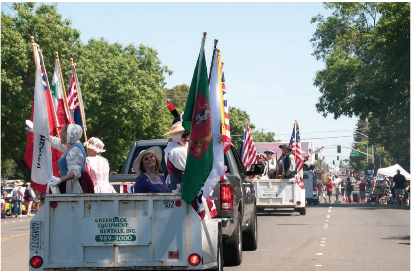
The Sons of the American Revolution Parade Contingent