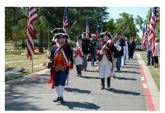
Color Guard at the Memorial Day Parade