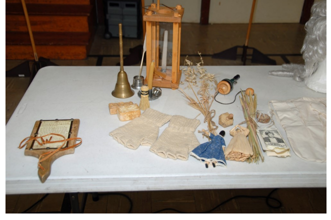
Props used by the School Guard for their presentation