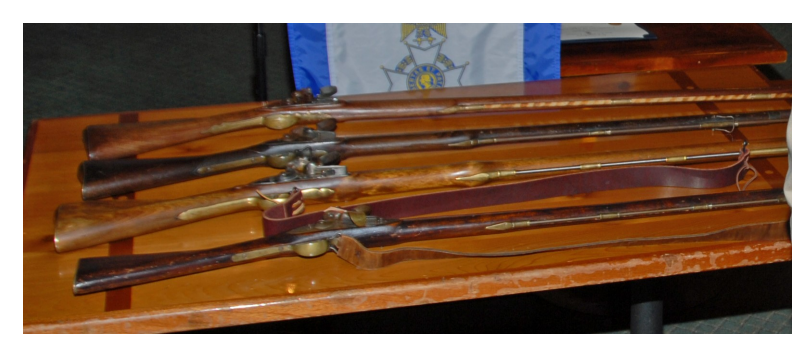
Revolutionary War Rifles