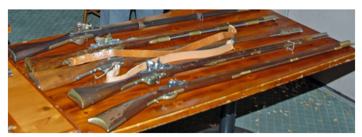
Revolutionary War Era collection of weapons