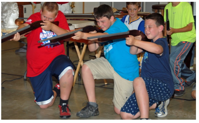
Learning how to load and fire in battle formation