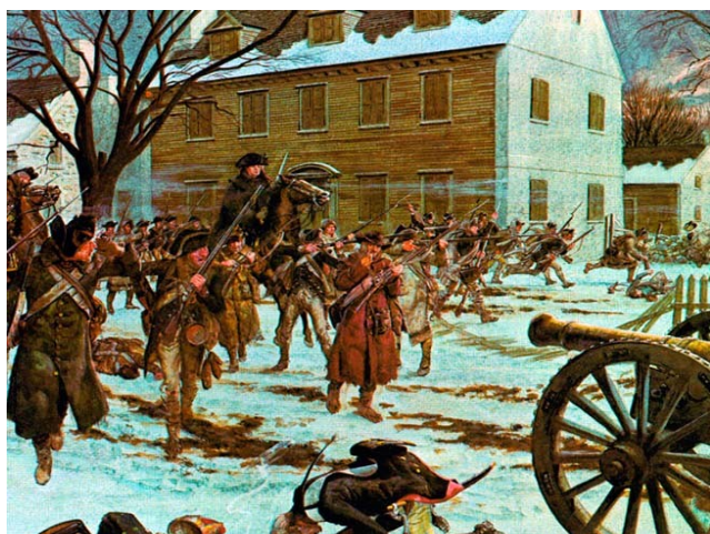
Depiction of the Continental Army at the Battle of Trenton

about a month later by escaping from Manhattan to New Jersey across the Hudson River.