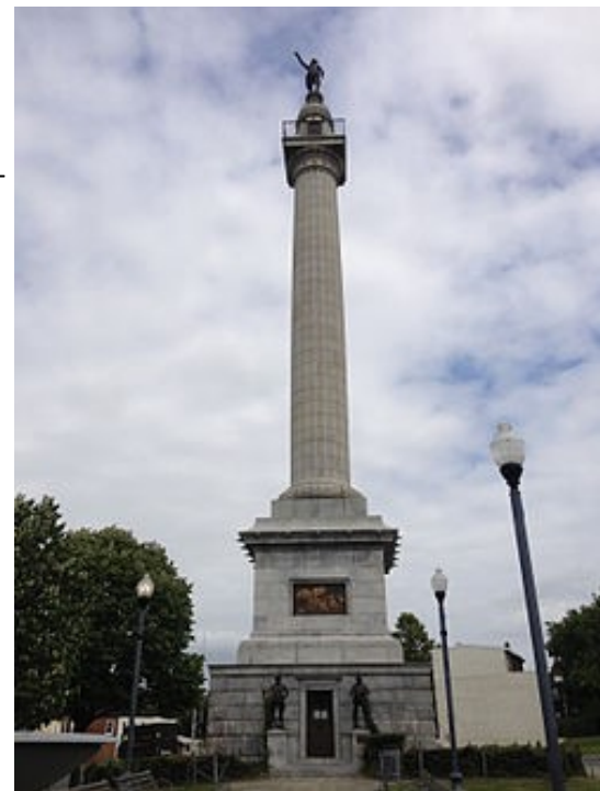
Battle of Trenton Monument

Washington then hurried on overland to New York. The British reorganized in Halifax, Nova Scotia and then proceeded to New York by sea. The British arrived in New York harbor in August 1776 with 400 ships carrying 32,000 men who landed on Staten Island. The subsequent engagements were mostly one-sided British triumphs. The Continentals were out maneuvered, outnumbered and outfought. Washington, though, distinguished himself by engineering two miraculous escapes from the British Army. First an overnight retreat across the East River from Brooklyn to Manhattan under cover of darkness, and then he repeated the feat