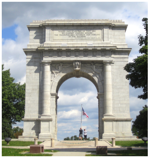
NAKED AND STARVING AS THEY ARE WE CANNOT ENOUGH ADMIRE THE INCOMPARABLE PATIENCE AND FIDELITY OF THE SOLDIERY

They have both agreed to speak at our September dinner meeting and share their experiences and impressions of this program with us. This promises to be a very interesting and exciting meeting, so don't miss it.